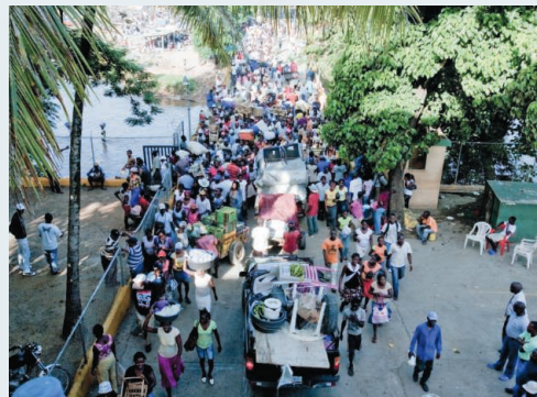
Easy access. Malaria hitches a ride into the D.R. with the throngs of Haitians who cross the Massacre River on market day.